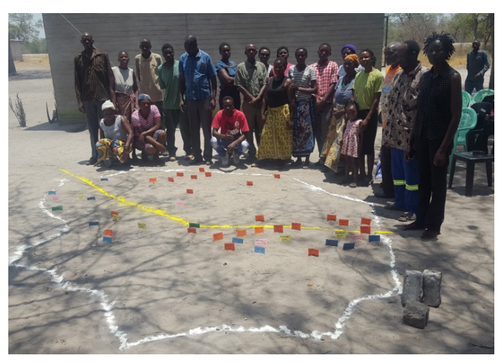
Participants at the Balyerwa meeting with a map outlining land use in their conservancy