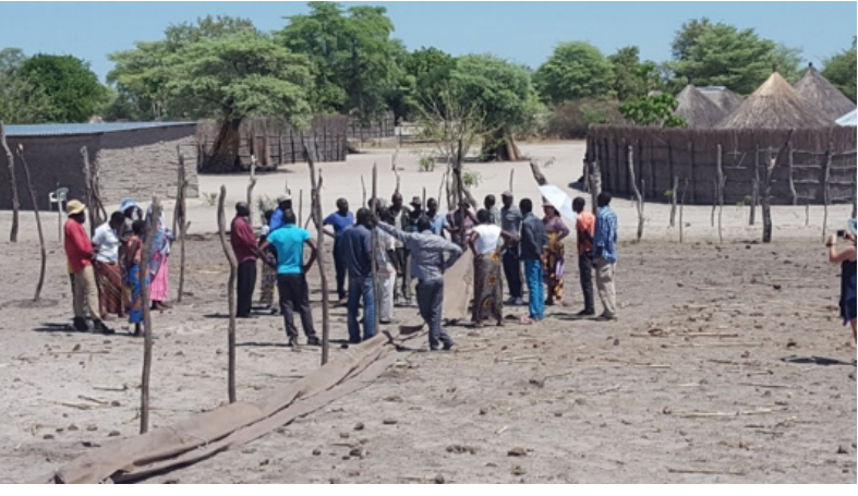
Interested farmers from Dzoti conservancy putting up a mobile kraal under the guidance of KCP

Dzoti Consevancy has revised its land-use zonation plan to make way for good rangeland management. We hold regular meetings with the farmers and other stakeholder in Kakiramupepu and Silonga to raise awareness about the development of a rangeland management plan. A Grazing Committee has been established and a grazing plan is in the process of being implemented to reduce conflict between livestock and predators. A key aspect of the plan is to ensure that seasonal wildlife movement and wildlife corridors are considered during planning. The plan also ensures that farmers do not graze livestock in specified tourism zones.