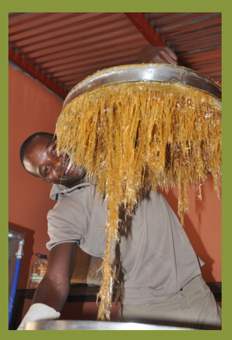
Staff members operating the stills at OPF are from the conservancies and have received training in processing techniques

Until recently, no essential oils were produced in Namibia. However, Commiphora species in Kunene region have long been used by Himba women as the major ingredient of their perfumes. In the early 1990's, IRDNC had been considering investigating this genus as a potential source of income for Himba communities but was reluctant to do so until appropriate institutional arrangements were in place for the sustainable management of this resource should it be harvested. With the change in legislation in 1996 and the subsequent registration of conservancies, the necessary community management structures now existed and the research was launched at the end of 2004. At that time, most conservancies derived their income from wildlife and wildlife-based tourism. In Himba communities, the women are the managers of the plant resources and are responsible for the harvesting of the Commiphora resins. For these reasons, IRDNC's work initially focused on the women in the two conservancies and later expanded to other neighbouring conservancies.