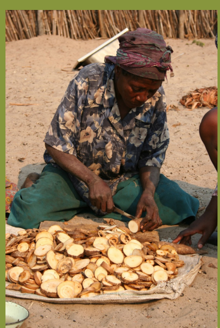
Training is provided on sustainable harvesting and processing methods