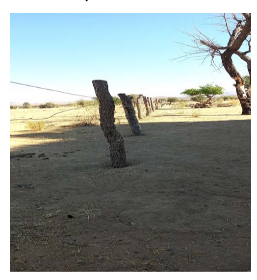
This is a sample of a stone fence